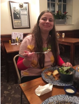
Mr Blobby enjoying a post rally 'spoons