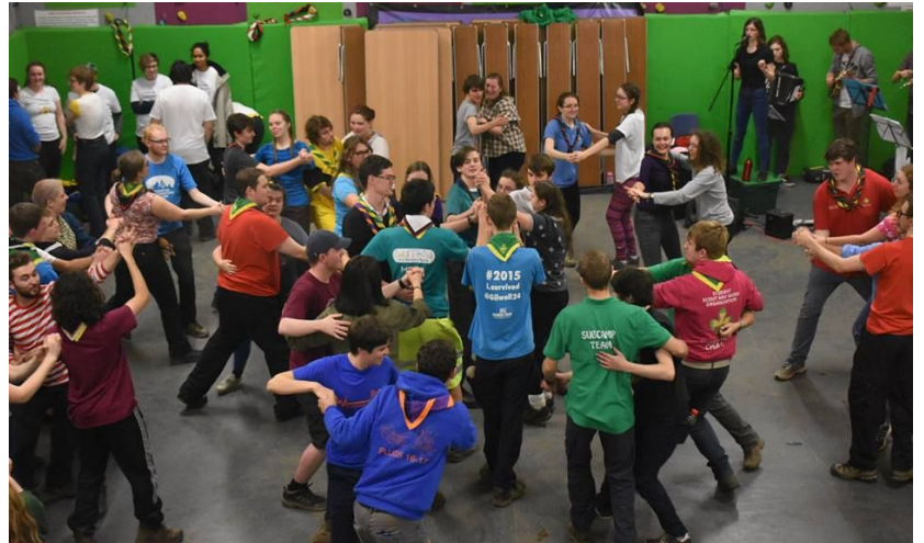
Not the Drinkers Badge winners, but still quite drunk!