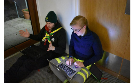
The Rally media team for all their hard work this weekend, hope you liked "Woody's Roundup"!